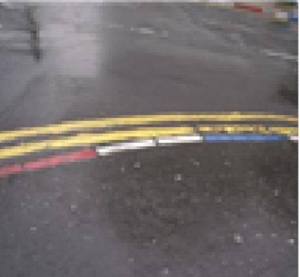
'Separated by colours'

For the Thornhill College pupils, the opportunity to learn from the community in Glasgow about issues resulting from the Home Office Dispersal Act in 2000 naming Glasgow as a reception city for Asylum Seeker families was a very powerful learning experience for their citizenship education.